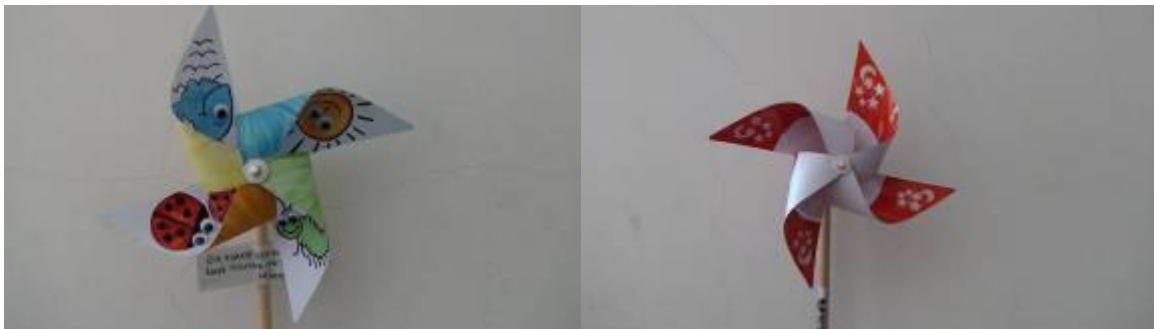
Windmills designed by students.