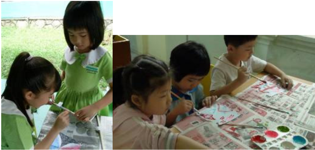
Students creating windmills for Orchard of Windmills .