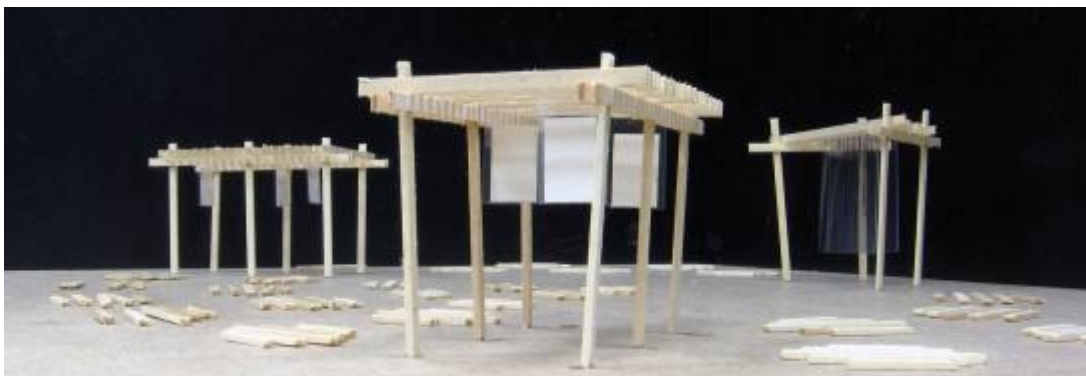
Selected windmill designs will be featured in the pavilions.